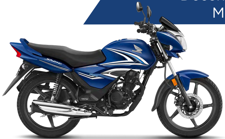
Decent Blue Metallic