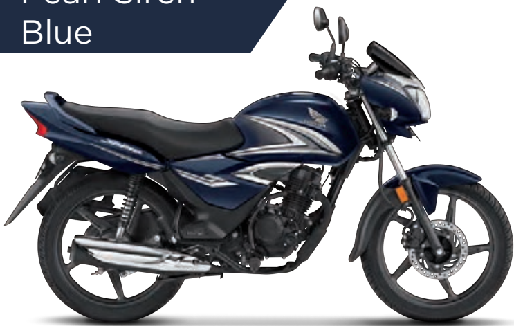
Pearl Siren Blue